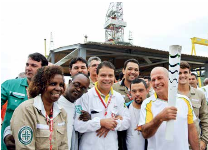
As a beacon of inspiration in the community, Keppel Volunteers Brazil will continue to light the way for beneficiaries such as special needs students

Keppel FELS Brasil's BrasFELS shipyard has fostered an active volunteerism culture. Over the years, the shipyard's employees have extended time and talent to beneficiaries including the elderly, children and youth, as well as the environment.