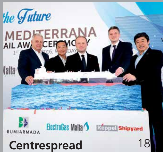
Sail away ceremony for Armada LNG Mediterranean, an LNG Floating Storage Unit