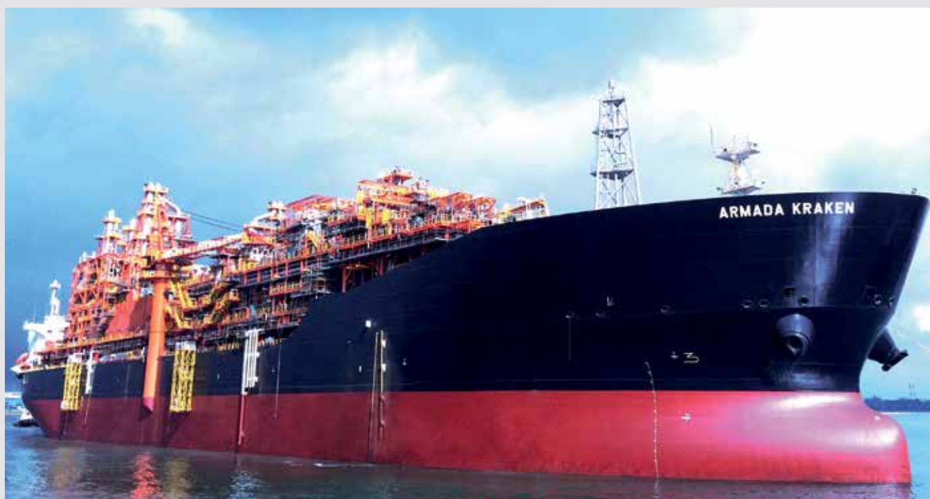
Armada Kraken is a complex harsh environment FPSO which meets the stringent requirements for the UK North Sea