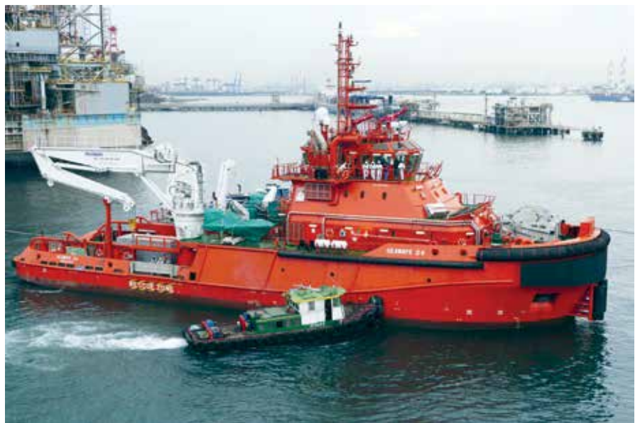
Seaways 24 is the fifth AHT unit that Keppel Singmarine has delivered to Seaways International to-date