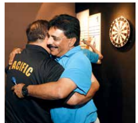
Players from rival teams encouraged one another at the Keppel Games Darts Challenge in a show of sportsmanship

The Sunday event concluded with an exchange of hearty handshakes and words of encouragement