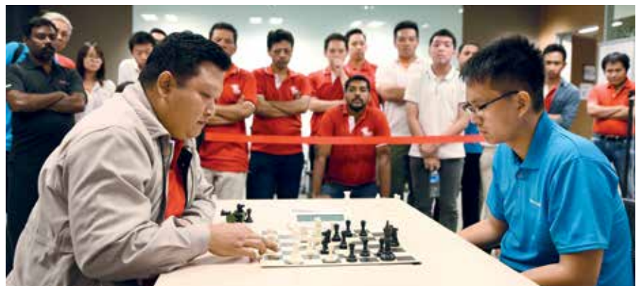
The atmosphere at the International Chess event was intense as participants carefully contemplated each and every move hoping to outwit their opponents

A total of 42 players from the three teams were fielded for the championship trophy at Wisma AUPE on 14 August 2016.