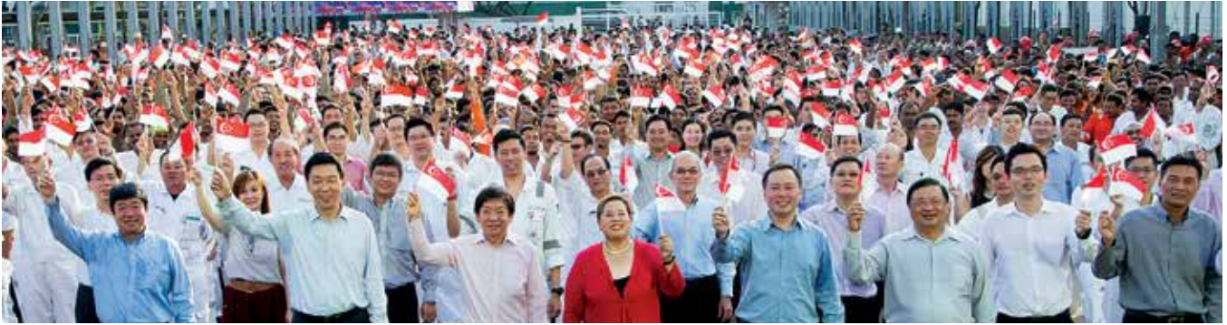
Mr Khaw Boon Wan (front row, third from left), Singapore's Coordinating Minister for Infrastructure and Minister for Transport, marked the nation's 51st birthday with Keppel Offshore & Marine's board and management, union leaders and staff

Around the world, Keppelites from Singapore commemorated the country's 51st National Day.