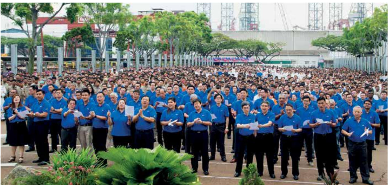
From management to union members, Keppelites pledged their commitment to intervene to stop any unsafe work in line with the theme of Keppel FELS' safety campaign theme