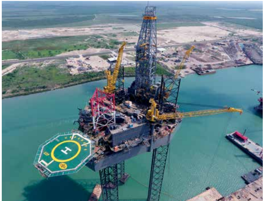
Uxpanapa is the the fifth jackup rig built by Keppel AmFELS for Perforadora Central and is the second jackup rig based on Keppel's proprietary KFELS B Class design

PEMEX, the Mexican national oil company, for work in offshore Mexico. Keppel AmFELS' past collaboration with PEMEX includes having built two 220-men accommodation modules for Pemex in 2006, as well as repairing and servicing a total of 18 rigs for various drilling operators that have been chartered by PEMEX over the years.