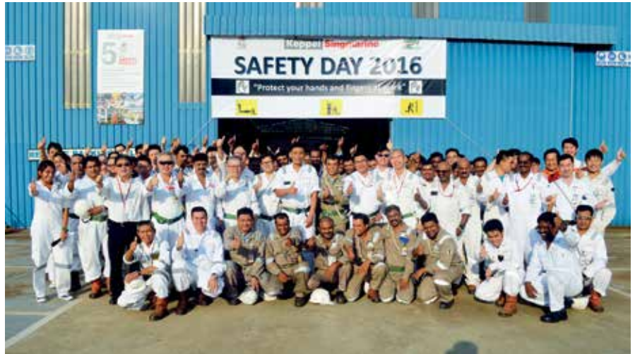
Attracting over 1,100 participants, Keppel Singmarine's 'Safety Day 2016' focused on promoting positive intervention to prevent incidents, in particular hand and finger injuries

Over in China, Keppel Nantong launched a safety promotional campaign on 28 July 2016. Through a series of activities and contests, the campaign seeks to foster a stronger safety ownership in all Keppelites.