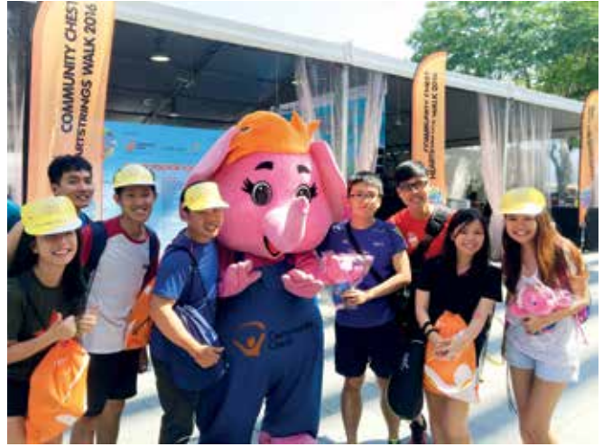
Keppelites participated in a charity Heartstrings Walk organised by Community Chest