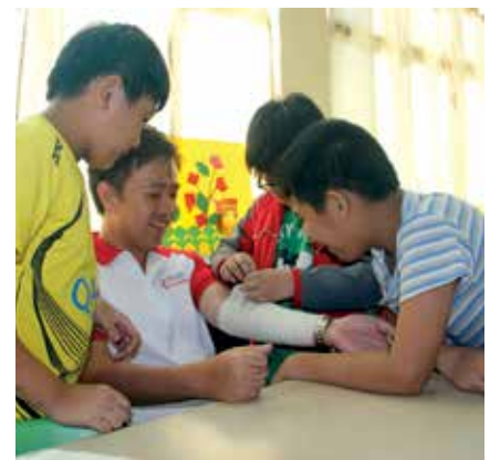
Children eagerly practiced their newly acquired first aid skills on the volunteers

In line with Keppel's strong safety culture, Keppel Volunteers partnered with Agape First Aid to impart first aid skills to the children from Care Corner (Admiralty). The volunteers attended a session on bandaging methods with 30 under-privileged children between the ages of seven and 12 from the family-care centre.