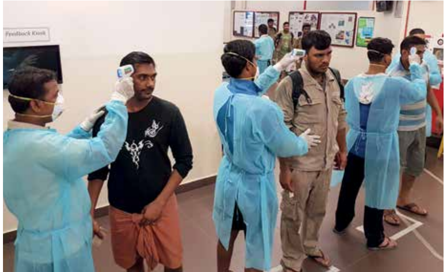
Keppel Housing personnel are trained and equipped to screen all residents for symptoms of a flu pandemic

Keppel's Acacia lodge and Cassia@Penjuru dormitory were immediately activated and within 30 minutes, appointed personnel at the lodges were equipped and on standby to screen anybody coming in or going out for symptoms. Quarantine rooms were set aside and contact tracing procedures prepared. The exercise scenarios took place over six days