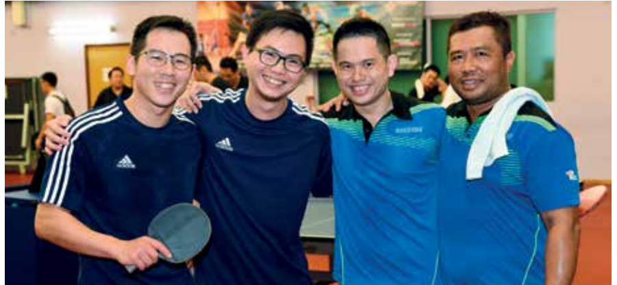
The men's doubles pairs from Team Caspian (in black) and Team Atlantic (in blue) were all smiles after an exhilarating final, which was eventually won by Team Caspian

This year's Darts Challenge was a show of precision, mental acuity and sportsmanship.