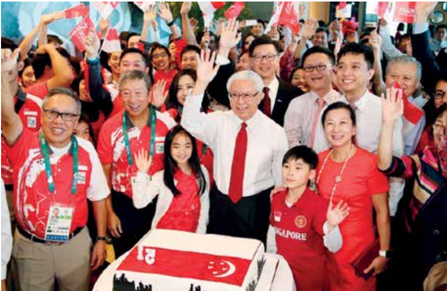
President Tony Tan (centre), together with sports officials and Singaporean Keppelites from BrasFELS, commemorated Singapore's birthday and the nation's first-ever Olympic Gold medal at a National Day reception hosted by the Embassy of Singapore in Brasilia

Singapore's historic win at the Olympic Games is particularly uplifting and memorable. It is an honour to be able to commemorate Singapore's National Day and the fighting spirit of its people with President Tony Tan, the nation's leading athletes and dedicated sports officials as well as the Singaporean community in Brazil."