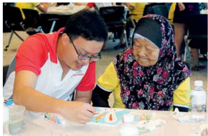
Keppel Volunteers and elderly beneficiaries spent an enjoyable morning painting by numbers