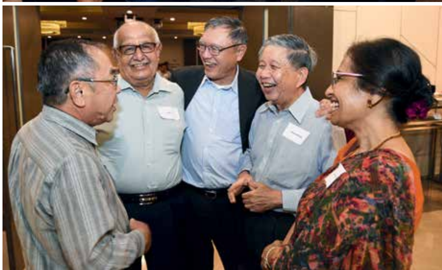
It was a night to remember for Keppel's senior management and alumni members who caught up with former colleagues and longtime friends during the annual KOM Alumni dinner