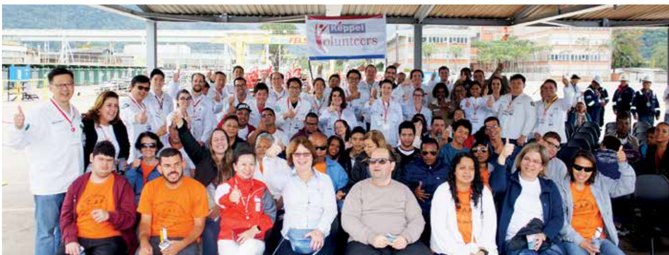
BrasFELS hosted special needs students and their teachers on a visit to the shipyard in conjunction with the inauguration of Keppel Volunteers Brazil