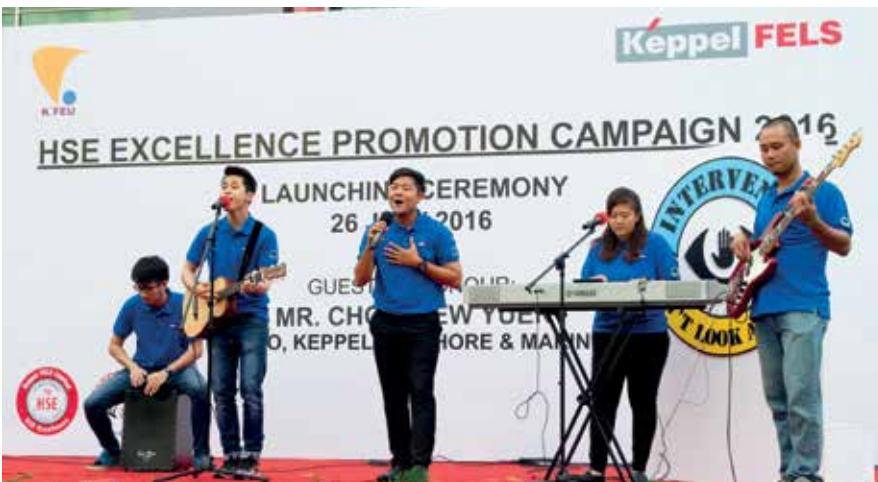
Lending voices to safety are young and talented Keppelites who composed and performed the theme song for Keppel FELS' 20th Health, Safety and Environment Excellence Promotion Campaign

Separately, Keppel Singmarine held a two-day safety promotional