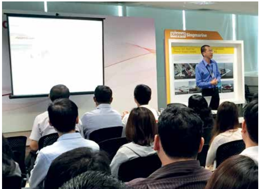
Keppelites gained insight on integrating innovation into their work processes