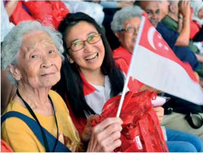
Keppel Volunteers and elderly from Thye Hua Kwan Seniors Activity Centre bonded over an enjoyable evening at the National Day Parade preview