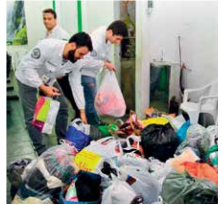
BrasFELS employees contributed bags of winter clothing to homeless individuals through Project Daniel, a programme that seeks to uplift the needy