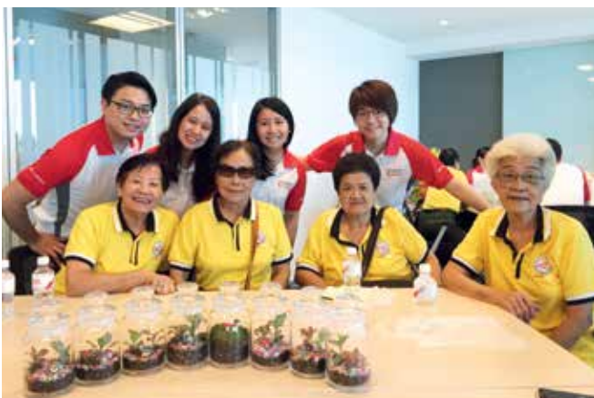
Elderly from Thye Hua Kwan Bedok Radiance Seniors' Activity Centre created their own terrariums with Keppel Volunteers