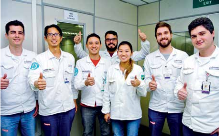
BrasFELS' Synergy team encourages employees from various departments to share and implement ideas for improvement

BrasFELS launched its Synergy Programme in April 2016, drawing on Keppel FELS' starter kit and experiences in this programme.