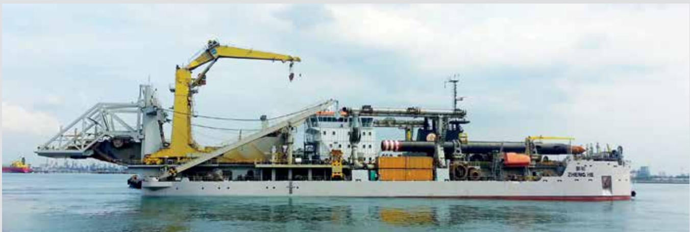
Keppel Singmarine strengthens its track record and expertise in specialised vessels with the securing of new dredger contracts from Jan De Nul