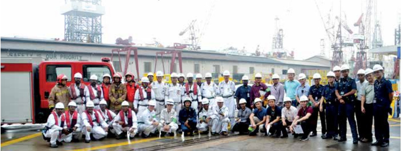
Keppel's emergency response readiness was put to the test during a BCM exercise in coordination with the Singapore Police Force and Singapore Civil Defence Force

The BCM plan was developed to identify potential threats and their impact on the organisation's operations. This in turn will help in the development of response, continuity and recovery plans to ensure the critical functions recover promptly and increase the organisation's resilience to unplanned disruptions in assets and personnel.