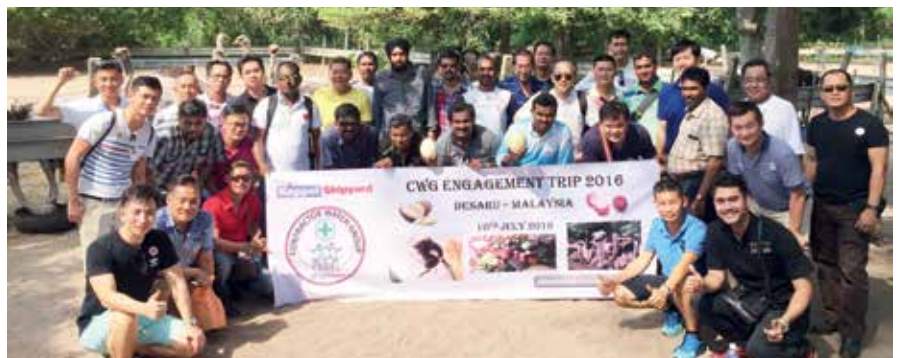
Keppel Shipyard bonded with its contractors during an engagement trip to Desaru, Malaysia

is the second overseas engagement that CWG has organised. It is a great success, seeing how everyone had a great time and created higher rapport with one another."