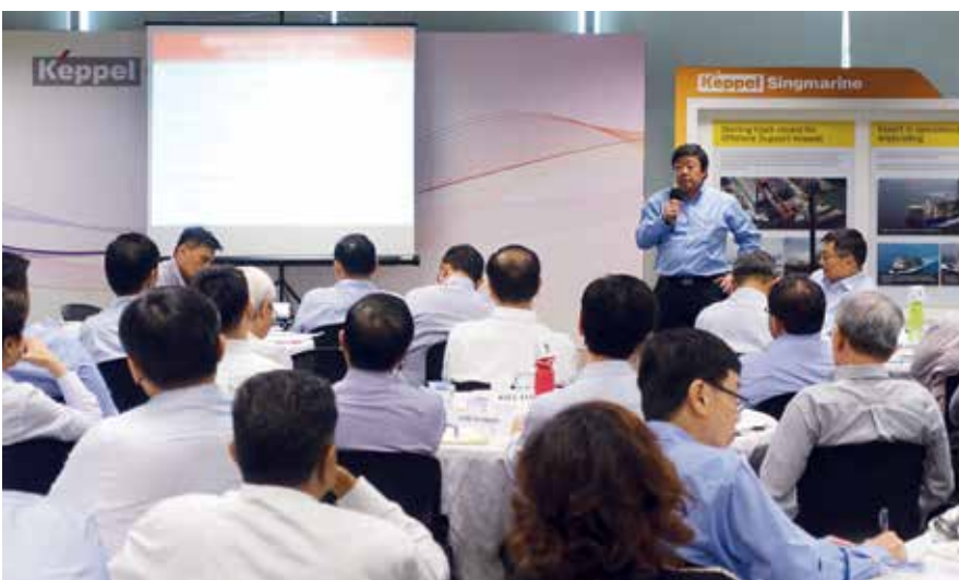
Senior management from across Keppel O&M's operations worldwide gathered to set the course for the company's future

Encouraging the team to look critically into adapting current technologies and know-how for new applications, he said, "We are not just in the offshore and marine business, the technology that we have can be used in multiple areas. We also need to look internally at how we can work and relate with one another to become more productive and efficient."