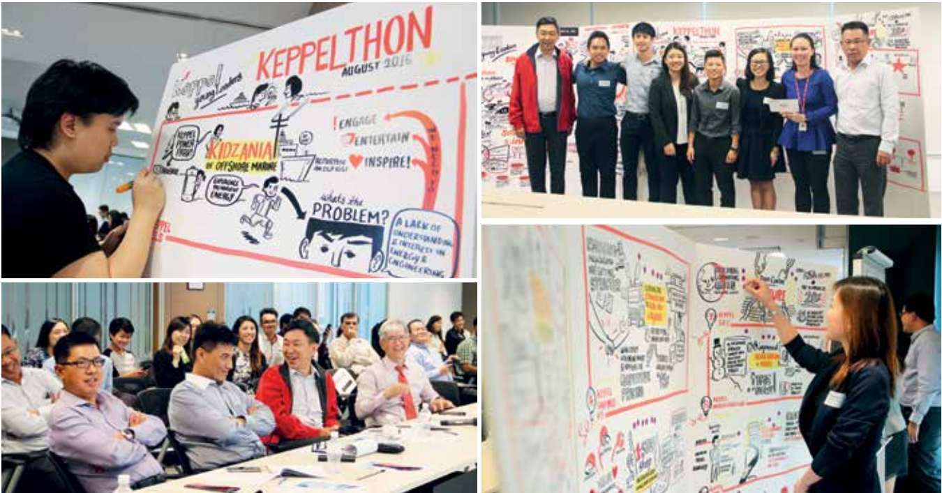
KYL successfully marked the finale of its inaugural two-day hackathon challenge involving more than 70 Keppelites across the Group

Across the group, Keppel has initiated programmes for promising young leaders to learn as well as express their ideas.